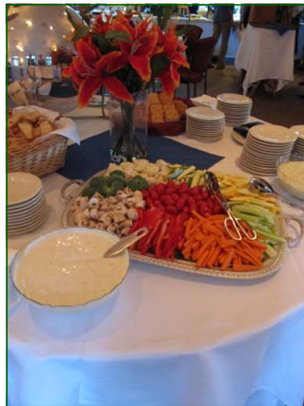
Woodstock Country Club Catering