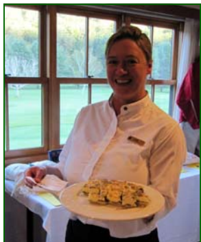
Woodstock Country Club provides great service!