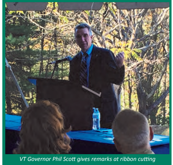
VT Governor Phil Scott gives remarks at ribbon cutting