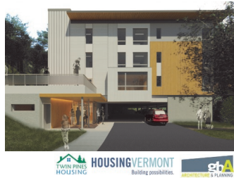
TWIN PINES HOUSING HOUSING VERMONT Building possibilities. ghA GROUP INC. & PLANNING

Construction on Wentworth Community Housing (formerly known as Sykes Mountain Avenue) began in mid-June, and the foundation is nearly complete. This highly efficient, ultra-low energy building will include 15 one-bedroom and 15 two-bedroom apartments for families with low to moderate incomes.