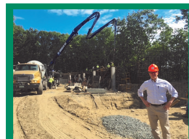
Wentworth Community Housing