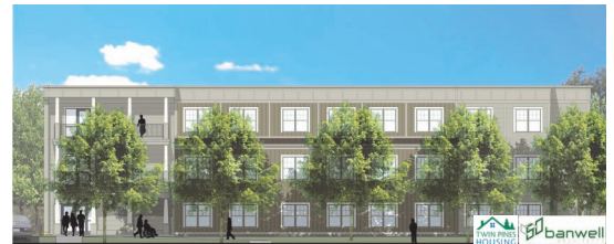
TWIN PINES HOUSING banwell

On May 8 voters in Hanover approved the transfer of the property at Summer Park from the town to Twin Pines Housing, contingent upon funding. Preliminary financing has been secured, and an application for Low Income Housing Tax Credits will be submitted in August.